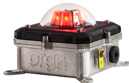
Orga Lighting Product - L85EX-R-AC-10